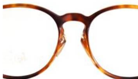
#5 Final appearance Leave two hours to harden.