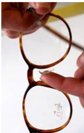
#4 Turn frame vertically and place pad against frame and hold for 30 seconds.