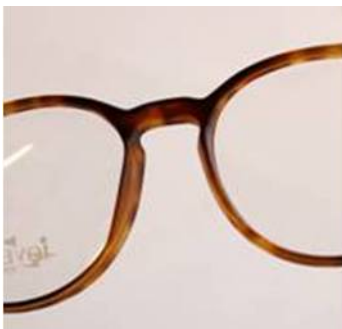
#1 The Frame