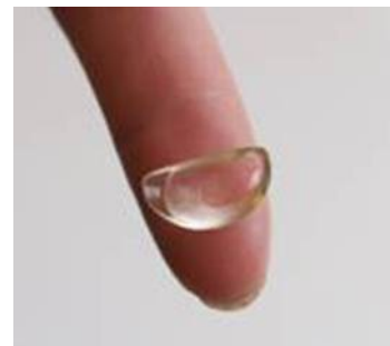
#3 Check position of pad placement - (Practice before adhesive is placed into cavity)