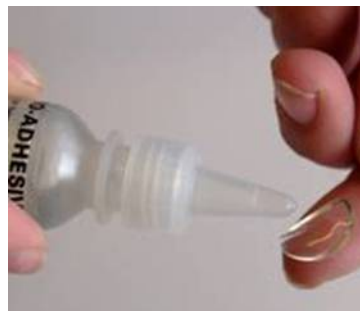
#2 Place the pad on finger and drop in the adhesive until cavity completely filled.